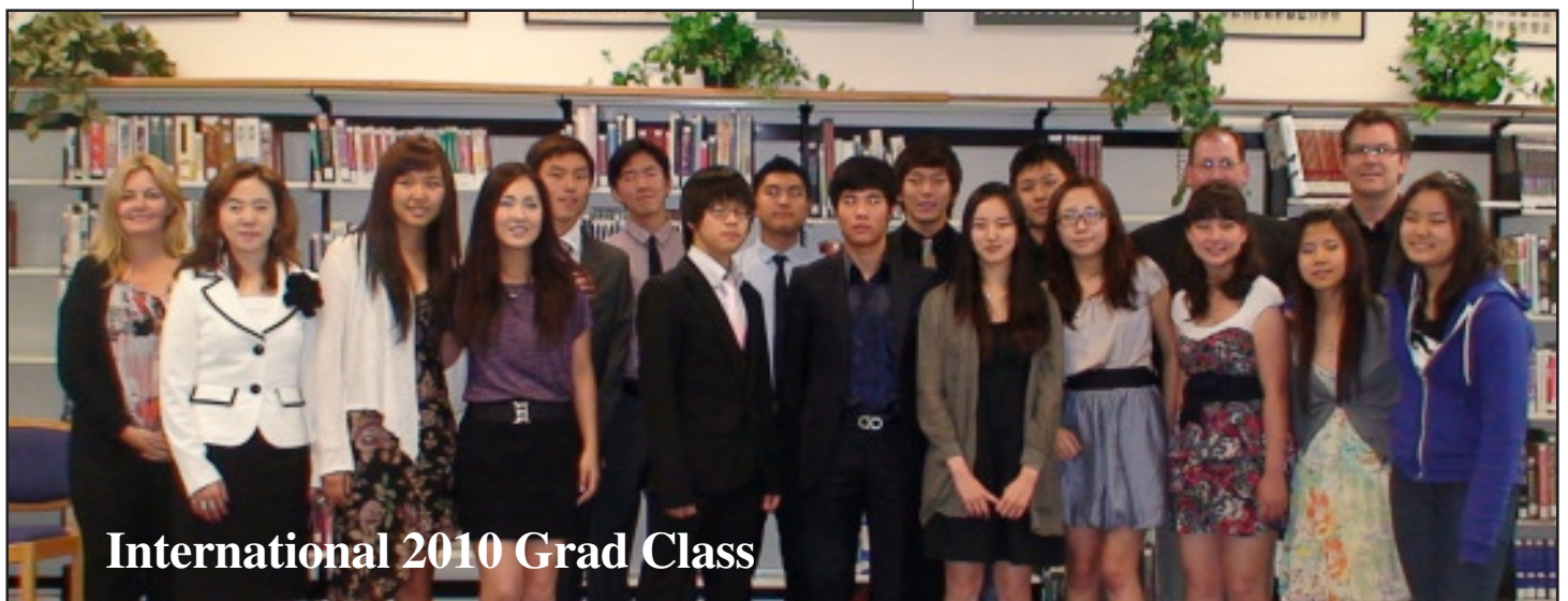
International 2010 Grad Class

moments of suspense, surprise and silly coincidences to keep us guessing on the outcome.